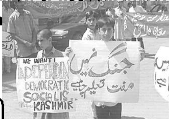
Young socialists in Kashmir